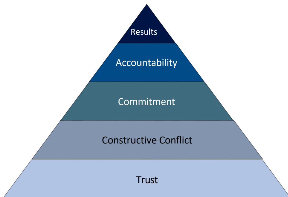
Figure 4. Lencioni’s 5 behaviours of a cohesive team

Lencioni’s pyramid of teamworking provides an accessible model outlining how trust, respectful challenge, commitment and accountability are key factors in successful team working.